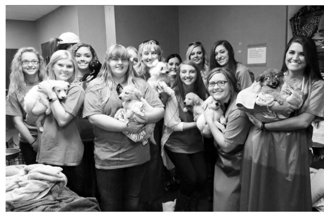
MIRS students and faculty volunteered at the Human Society as part of their day of service during Radiologic Technology week.